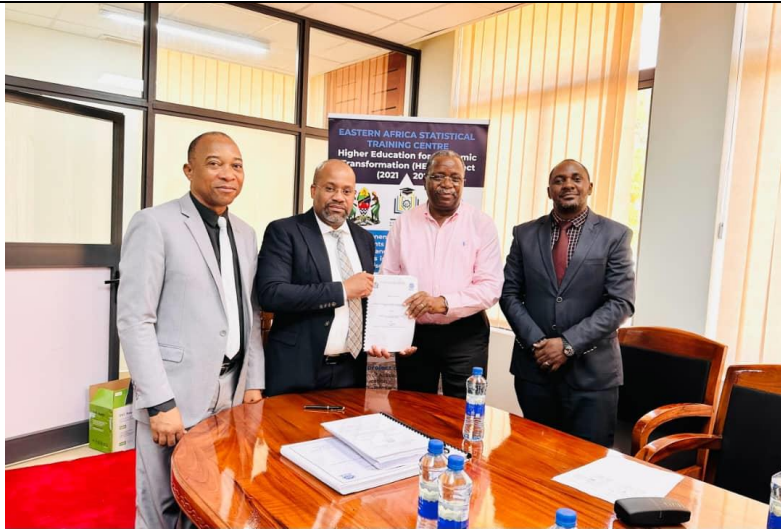
EASTC signed a contract with the contractor, WCEC, to carry out the construction of an academic block and the rehabilitation of related infrastructure. The signing ceremony was held on January 15, 2025.