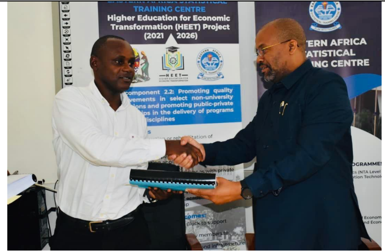
Training on Contract Management for EASTC HEET Project IPIU