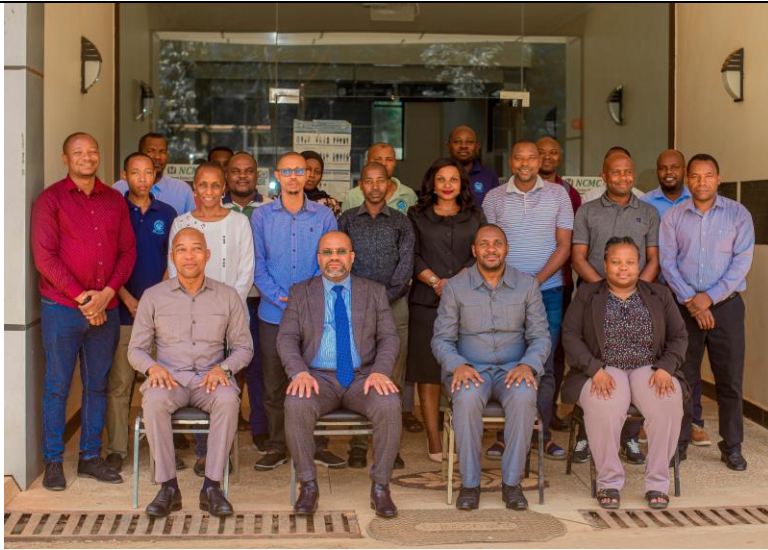
A workshop to review the validated curricula was held on January 18–19, 2025, in Morogoro, Tanzania